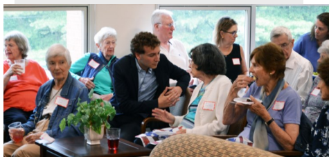
Senator Haskell visits the Senior Center

"I had a wonderful time and so appreciated the invitation. It was such a kind and welcoming group." —State Senator Will Haskell