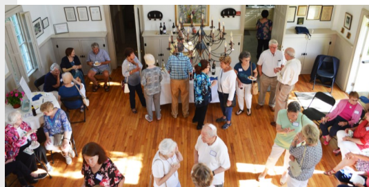
Volunteers honored at a special reception